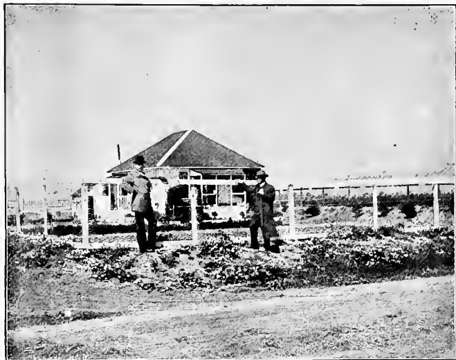
COLONIST'S HOUSE, FORT ROMIE.